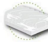
Wood pellet bags