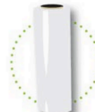
Pallet wrap & stretch film