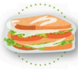
Ziploc & other reclosable food storage bags